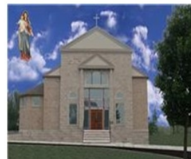
Mission Established 1855 Blessing of the Church Oct 2, 2010 A.D.

190 Mactaggart Dr. Nobleton, ON, L0G 1N0