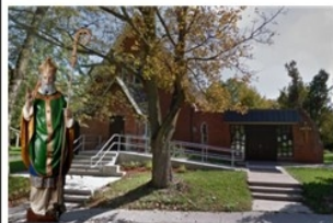
Established in 1876