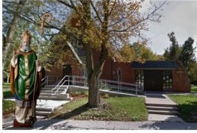
Established in 1876