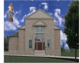
Mission Established 1855 Blessing of the Church Oct 2, 2010 A.D.

190 Mactaggart Dr. Nobleton, ON, L0G 1N0