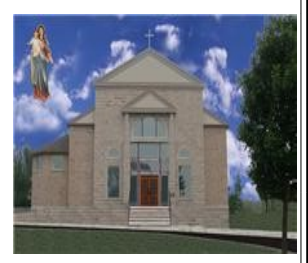
Mission Established 1855 Blessing of the Church October 2, 2010 A.D.