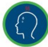
Not feeling well