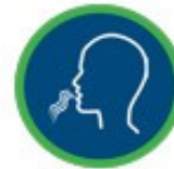
Nausea, vomiting, diarrhea